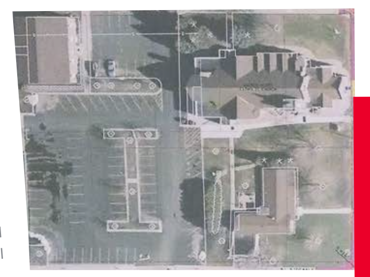
1ST AVE NW