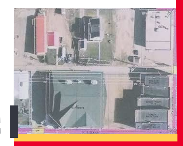
Eagle Bank drive-through access route