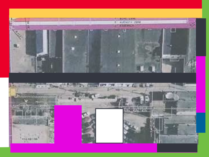
1ST AVE SE