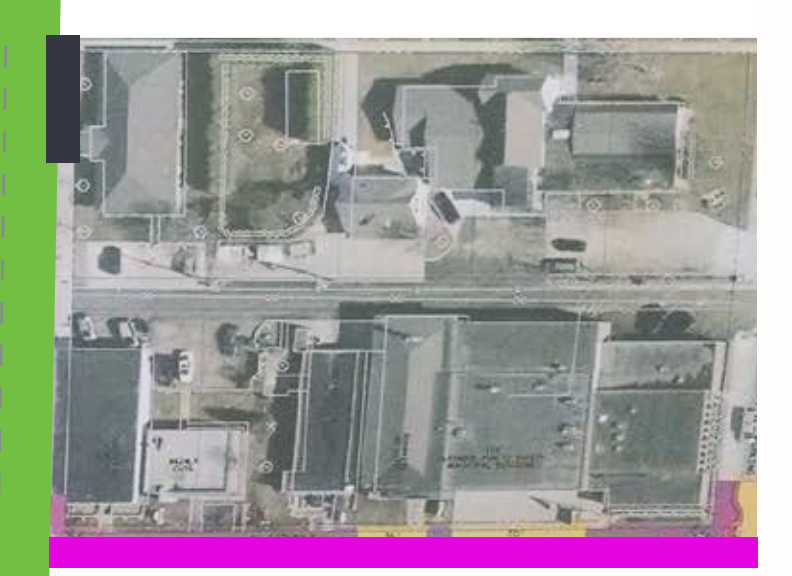
- MINNESOTA AVE/HWY 28 -